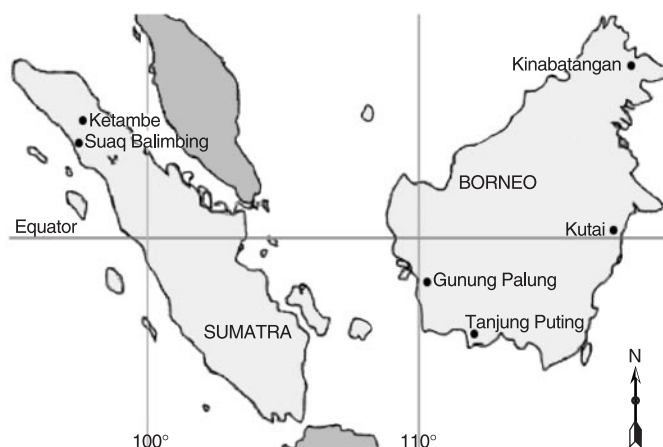
Fig. 1. Locations of the six study sites with long-term orangutan data included in this study.

These additional tests support a cultural interpretation of geographic variation in great-ape behavior and indicate fundamental similarities to human culture. However, because culture, as defined above, may be common among vertebrates (1, 17, 22), finer distinctions are needed for meaningful evolutionary reconstruction. Differences in cultures should reflect variation in the complexity of innovation and the mechanisms of socially biased learning. Thus, cultural elements may be (i) labels, where food preferences or predator recognition are socially induced (5, 7, 23) and which generally involve little innovation; (ii) signals, involving socially transmitted arbitrary innovations as variants on displays, such as kiss-squeaks on leaves or song